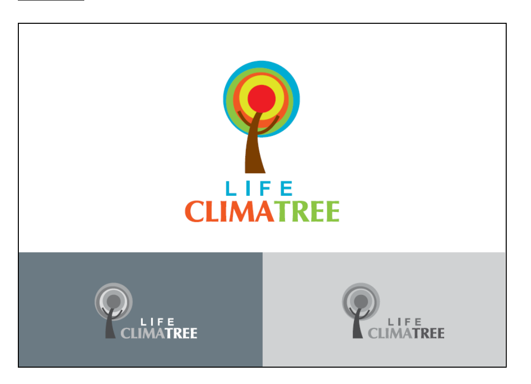
Figure 2: Alternative logo 2