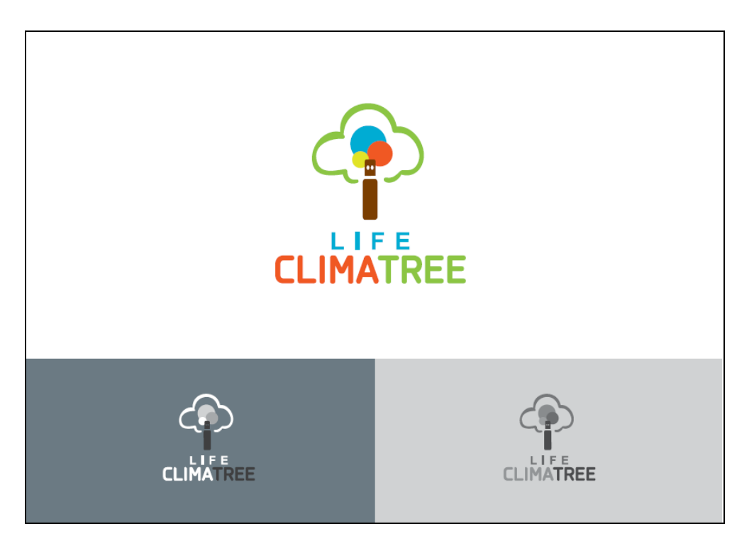
Figure 4: Alternative logo 4