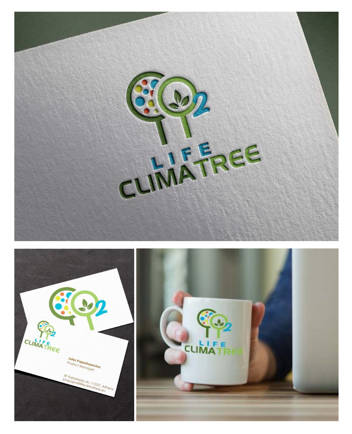
Figure 6: Demo applications of LIFE CLIMATREE's logo