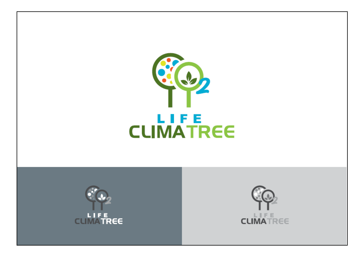
Figure 5: Selected LIFE CLIMATREE's logo in color, and grayscale