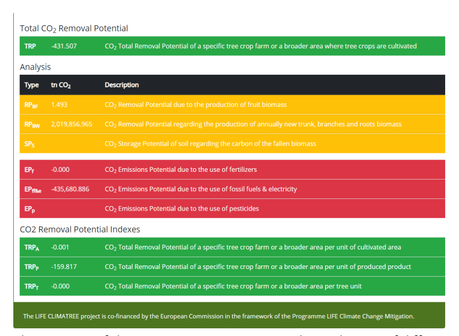
The progress of the C3, C4 Action permit now the evaluation of different cultivation methods.

The tree crops CO_2 Removal Capacity Algorithm (the excel tool) is used to run alternative cultivation scenarios by modifying specific parameters (e.g. use of pesticides, fertilizers, fossil fuels, electricity, management of prunings, etc.). The analysis of the results of these runs leads to important conclusions regarding the CO_2 removal capacity of the tree crops farms, the potentials for decreasing the CO_2 emissions due to the cultivation practices and the increase of the environmental performance of these cultivations. Based on these conclusions, measures and policies suggestions are developed towards climate change mitigation while simultaneously enhancing the feasibility of the tree crops agricultural sector through financial incentives and exploitation of the CO_2 removal capacity potential of the specific sector.